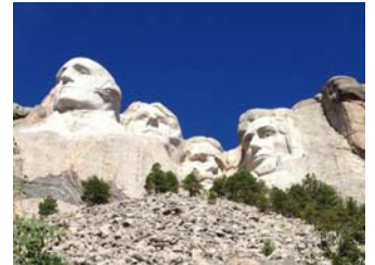
Mt Rushmore 1920s (below)

Tour Brochures are available at SIR luncheon meetings at the reception desk or on the branch #96 Web Site: WWW.SIR96.org