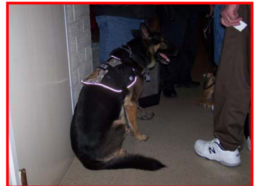
LEFT: Guy Sheble (left) and Chip Dingman from Silver Paw Ranch with two of their service dogs specifically trained to work with wounded veterans. The ranch takes rescue dogs and matches them with a wounded veteran and teaches them to work together so the dog can accommodate the human's needs.